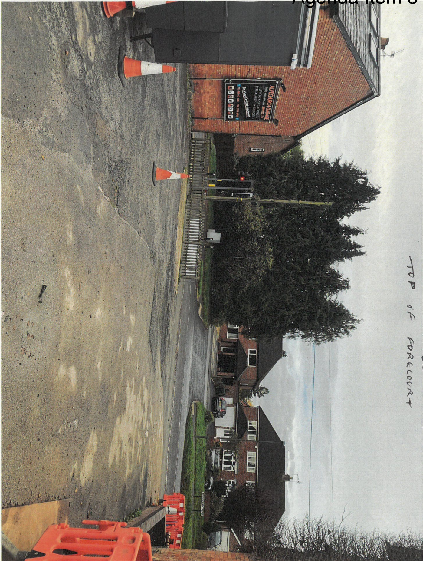
PARKING AREA VIEWED FROM TOP OF FORECOURT