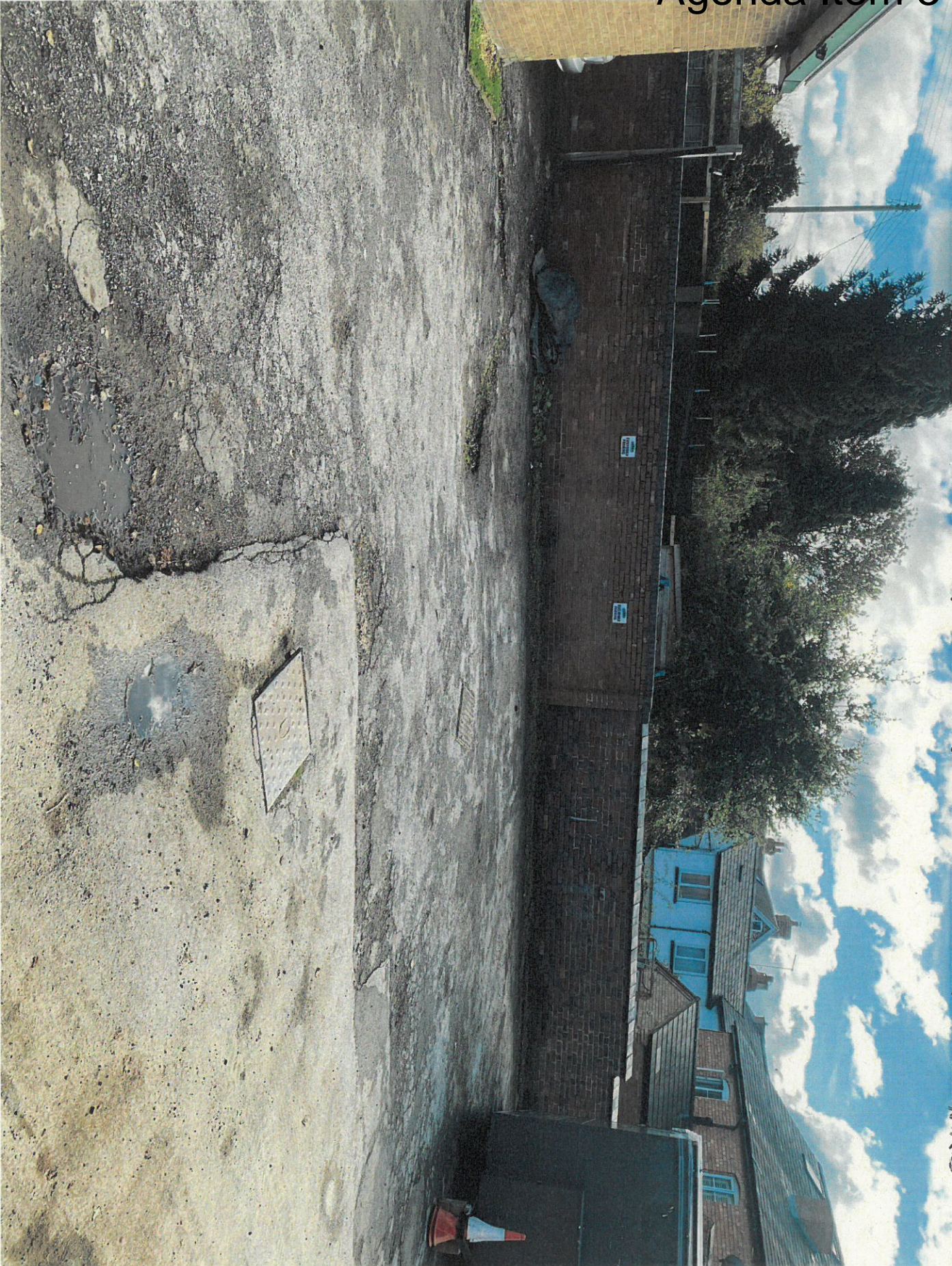
PARKING FOR GARAGE CUSTOMERS AT TOP OF YARD